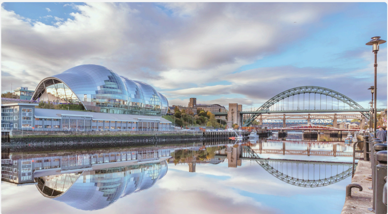
Photo of Newcastle.

A194 Wardley, Whitemare Pool, Nr. Gateshead, NE10 8YB Newcastle Central Station 5.3 miles